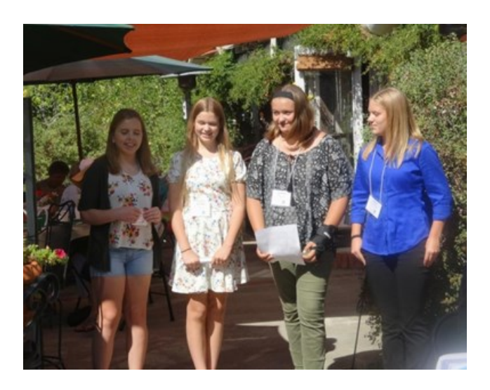
Our wonderful 2014 Tech Trek girls

Your donations to LAF (#3999) help support these plaintiffs and other like them who are struggling against injustice in the academic world.